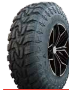
MUD CONTENDER M/T